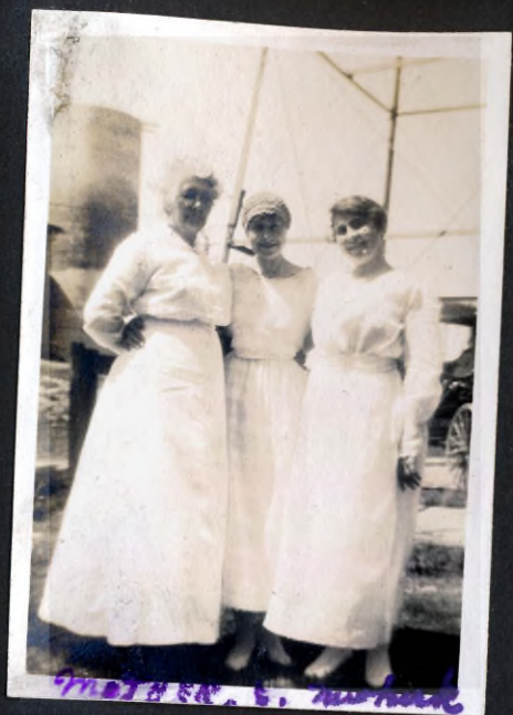
Three of the S. ...