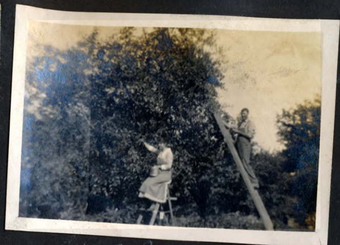
June 7 1912