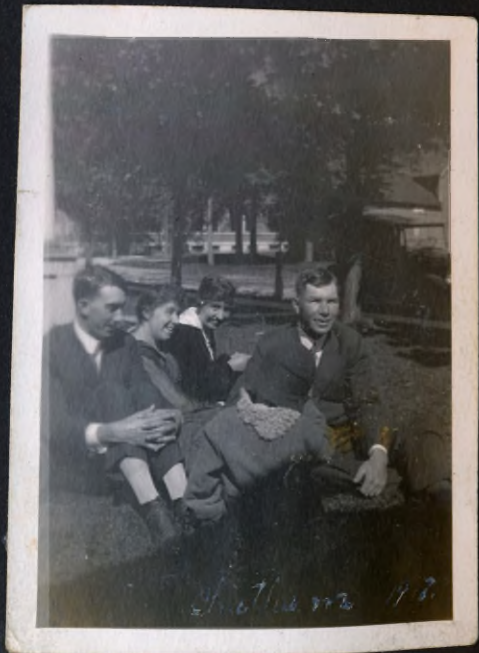
Another one 18